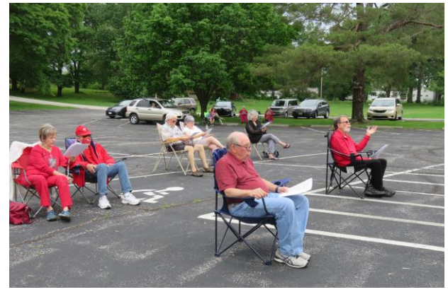
Parking Lot Participants